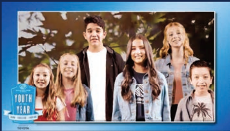
Special performances by Boys & Girls Club youth performers