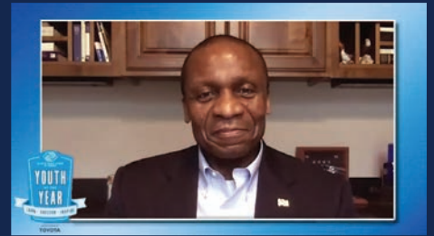
Remarks highlighting our long-standing partnership with the U.S. Armed Services to provide high-quality support and services to military-connected youth on and off installations