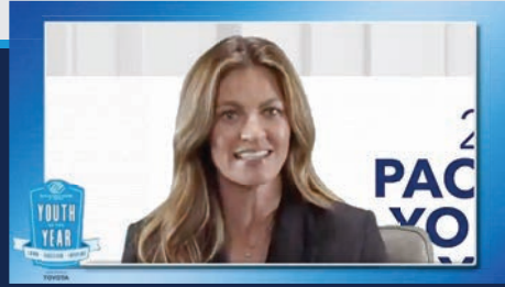
Celebrity emcees, like Erin Andrews at the Pacific YOY Experience, hosting and introducing all regional Youth of the Year participants