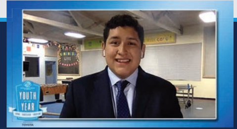
Inspiring personal stories from each of the youth finalists